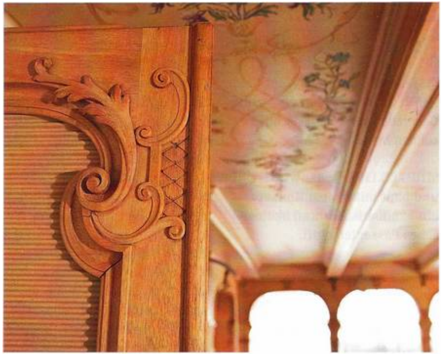
Restored woodwork and ceiling painting in the 1st class saloon

You can find further information about the activities of the Unterwalden in the "Dampfschiff Unterwalden Jahresprogramm 2011" (annual programme). This can be found at the ship's ticket office or online at www.lakelucerne.ch .