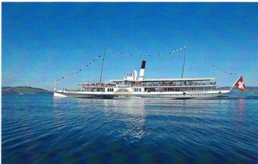
Die «Unterwalden» in neuem Glanz zurOck auf dem vierwadtstättersee.

From May 2011, the newly restored steamship Unterwalden can be hired for special occasions. She provides a wonderful setting for a cruise down memory lane, a cocktail party, anniversary celebrations, weddings, or banquets of any kind.